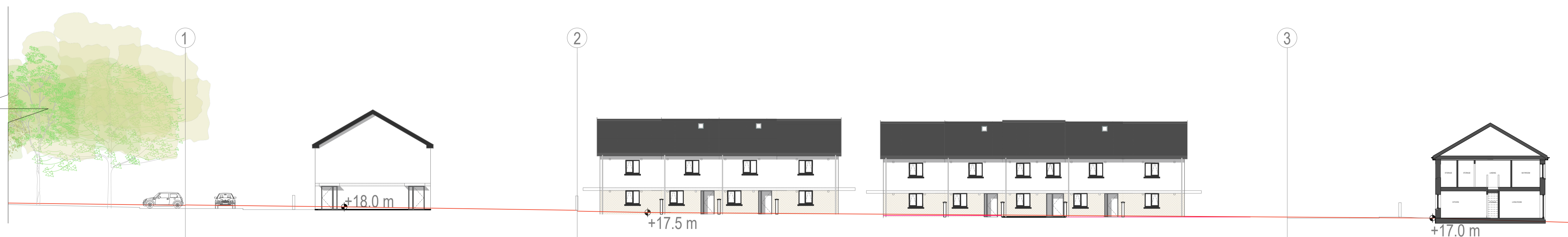
B-B ELEVATIONS- PART 2